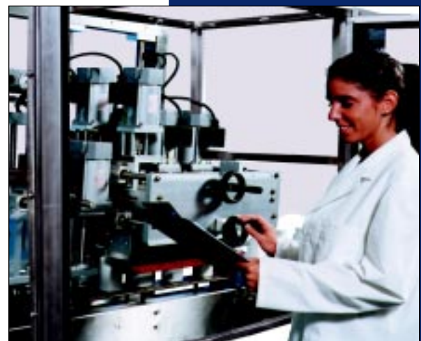
Quick handwheel height and width adjustment with position indicator

Optional Backlog Protection - Photo-eye monitors the line requirements, and stops and starts the optional infeed timing belts according to downstream demand.