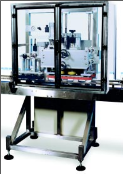
Retorquer with optional infeed side metering belts

New England Machinery, Inc. offers the latest technology with this Model NEPMT retorquer. If you are experiencing LOOSE CAP problems, the NEPMT is the solution. Due to industry demands of induction sealing for freshness and tamper evidence, caps tend to lose their torque. This equipment gives the peace of mind that you will not be faced with recall or quarantine due to loose caps, product spillage or contamination. The NEPMT is also designed to eliminate any rework or hand tightening which can induce repetitive task injuries.