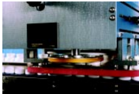
NEPMT-1 close-up of retorquing area